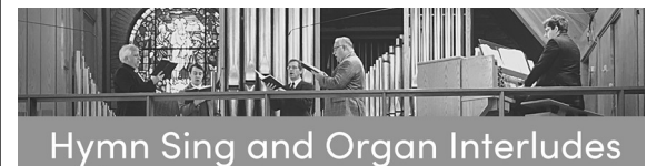
Hymn Sing and Organ Interludes

Remember to call the church office in plenty of time if you would like to sponsor the Broadcast($80), Informer($50), or Altar Flowers. We appreciate our sponsors.