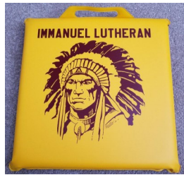
Stadium Seat Cushion