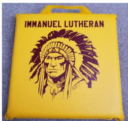
Stadium Seat Cushion