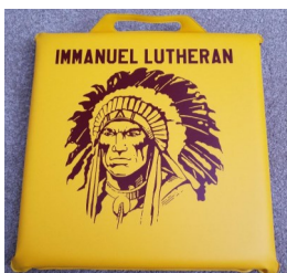
Stadium Seat Cushion